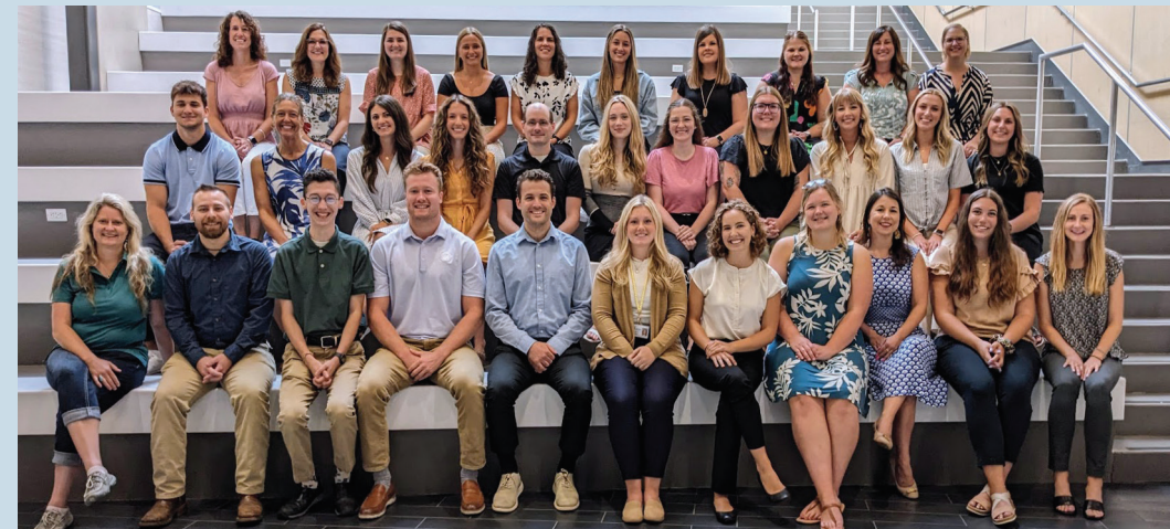
Penn Manor's new teachers pose for a photo during orientation activities.