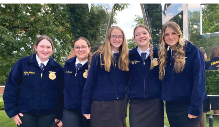
Manor FFA Poultry Team

Congratulations to these students and their agricultural education teachers on these awards!