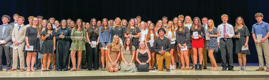
New members of the Penn Manor Chapter of the National Honor Society pose following an induction ceremony in the high school auditorium.