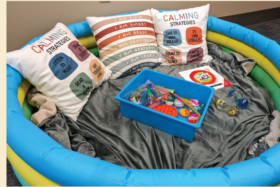
The "calming pool" helps students relax at Eshleman Elementary School

She and other counselors also purchased "A Little Spot of Feelings and Emotions" sets of books and plush toys that cover a variety of emotions, from anger, worry and frustration to calm, confidence and happiness.