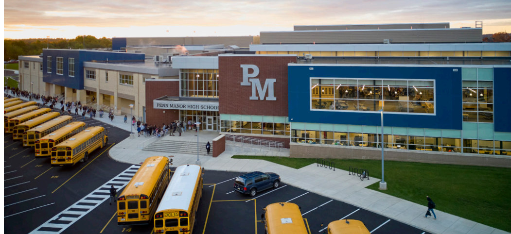
Penn Manor High School will officially mark its completion during a Dedication Celebration Weekend April 14 through 16.