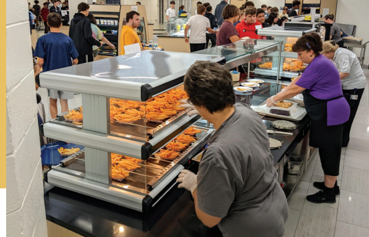
Food service workers serve meals in the Penn Manor High School cafeteria.

You can see our current vacancies on the district's employment website