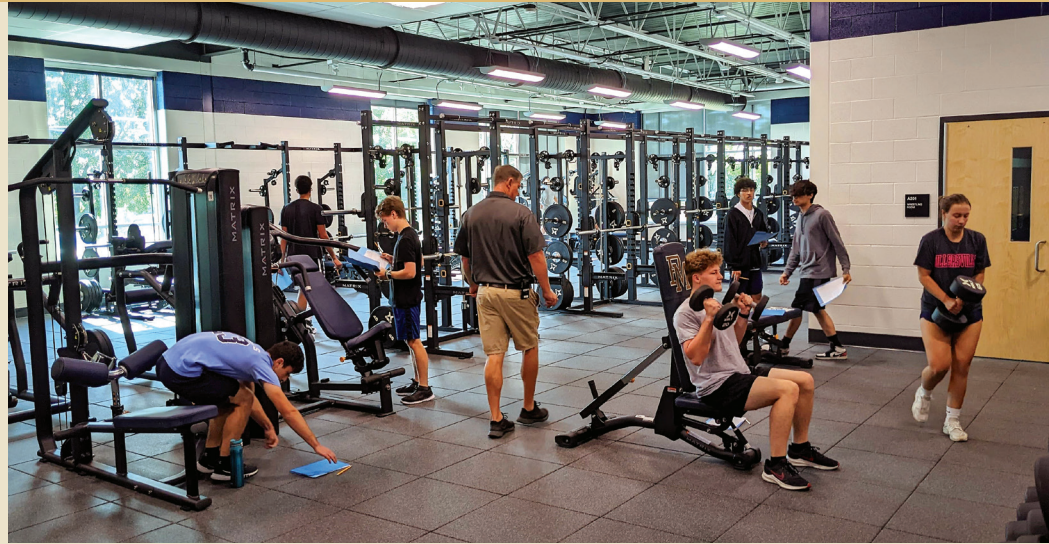
Above, students in a physical education class use the new high school fitness center. Below left, students circulate throughout the revamped cafeteria.

resulting in a new layout that reduces congestion and upgraded ovens that have improved the quality of cafeteria food.