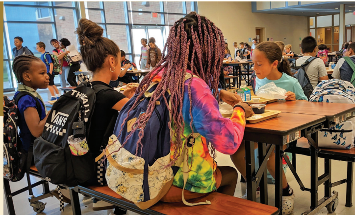
Students eat breakfast in the Hambricht Elementary School cafeteria.

the application process here: https://bit.ly/3qUekx6 .