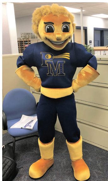
The new Comet Man

The new Comet Man is believed to be the fifth variation to entertain fans at Penn Manor sporting events since the Comet mascot name emerged in the 1950s.