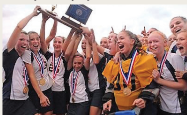
2008 field hockey team