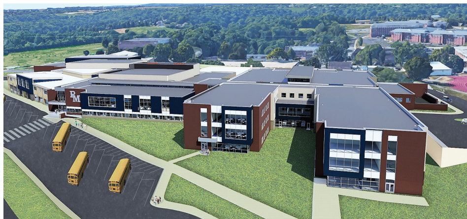
Above is an architect's rendering of how the school will look when completed.

Construction bids came in about $4.6 million higher than anticipated, but school district officials are confident the higher costs can be covered without an