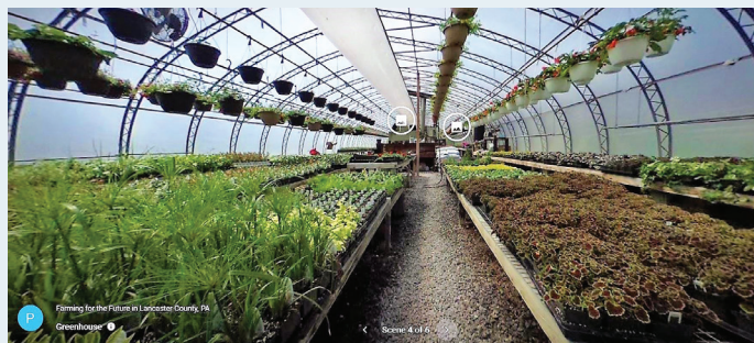
A greenhouse, above, is featured in this still shot from the VR tour. A Google crew, below, films students collaborating on the project.