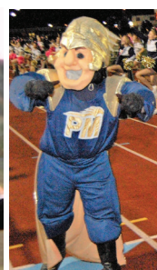
Penn Manor's mascot through the years: from left, the original Comet Man (1992-93), Comet Man (1997), Comet Critter (2006), and Comet Man (2012).

Critter in 2006, then reverted back to Comet Man, with a new design, in 2012.