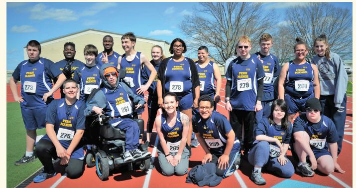
Penn Manor's Unified Track & Field team, above, poses for a team photo after the first meet. At left, an athlete receives encouragement.

The meets tend to be enthusiastic affairs with strong support from other students, teachers, family members and