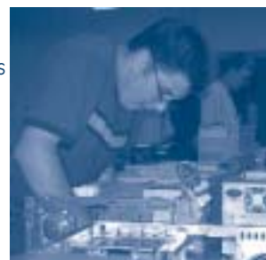
High school students joined with district technology staff to build 185 computers this past summer.