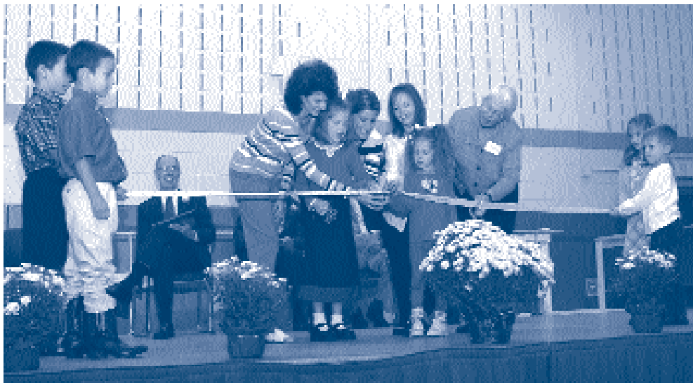
The newly renovated Fred S. Eshleman Elementary School was rededicated on Sunday, September 28 before a standing room only crowd in the new all-purpose room. Participating in the official ribbon cutting ceremony were descendants of Fred S. Eshleman.

The District completed 14 major construction projects totaling approximately 82.5 million dollars from 1986 to 2003. The unmatched cooperation of everyone involved, including students, faculty, administration, school boards, contractors, and support staff helped to insure that projects were successfully completed and schools opened on time. The buildings in the Penn Manor School District are in excellent shape.